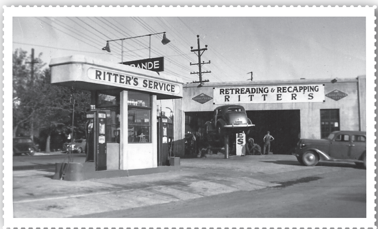
The Ritter tire business at 815 Third Street intersecting with Francisco Boulevard (formerly Toll Road), which was renamed "Ritter Street" in 1961